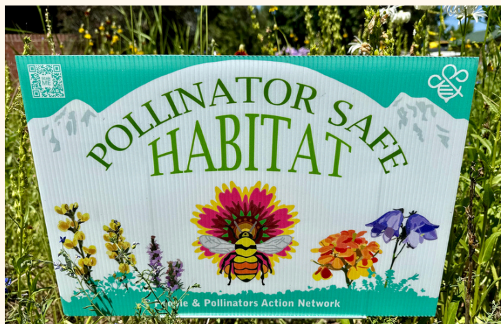
PPAN’s pollinator habitat sign

We want to learn more about your habitat project over the next few years. With that in mind, please include a one-page summary of your successes and challenges, progress in planting and maintaining the habitat, how you involved community education, collaboration and engagement in your project, and any other relevant information. In addition to the previous description, see below for specific report requirements for each year. Your first report will be due September 30 the year following your grant award. The second report will follow the same schedule. PPAN will send out a reminder for when these are due. We also ask that you to share any feedback you have regarding PPAN’s management of the Habitat Fund program (communications, support, areas for improvement, etc.).